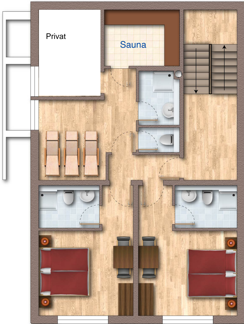
Second lower floor